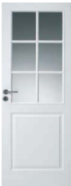
Annette 96/SP6 White