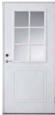
Puccini W35 Uvalue 1.4