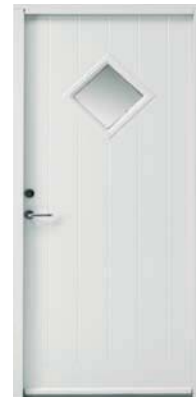
Barents W85 Uvalue 1.4