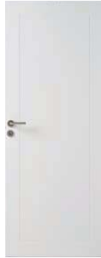
Bommen 207/E11 White