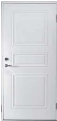
Puccini Uvalue 0.9