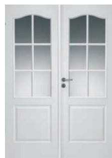
Karin 96/SP6B + SP6B White