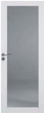
700/GW01L Glass White