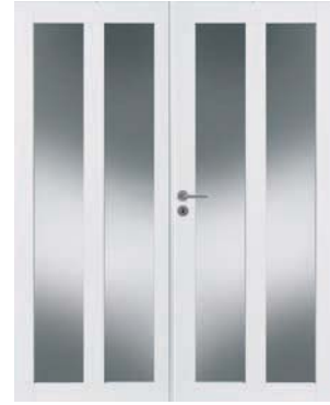
700/02V Birch Glass Pair