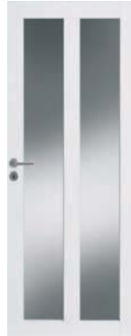
700/02V Glass White