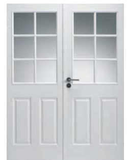
Margot/Dalsand 96/04SP6 + SP6