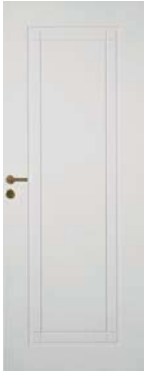
Rut 207/E58 White