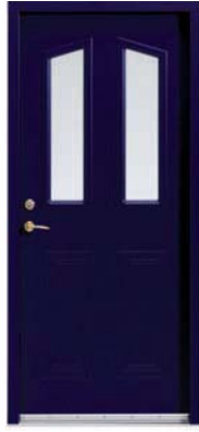
Repton Uvalue 1.4