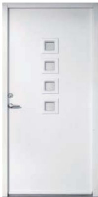
Delta Uvalue 1.4