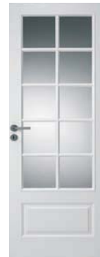
Gunilla 96/SP10 White