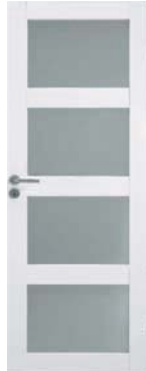
700/GW04L Glass White