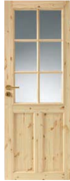
150/SP6 + SP3 Bodil