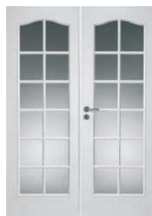
96/SP12B + SP12B White