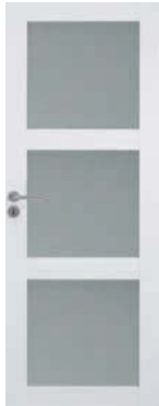
700/GW03L Glass White