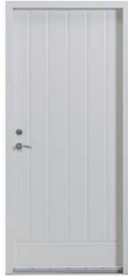
Barents Uvalue 0.9