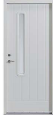
Roxburgh Uvalue 1.4