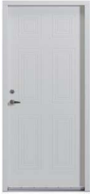
Donington Uvalue 0.9