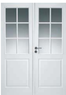
Annette 96/SP6 + SP6 White