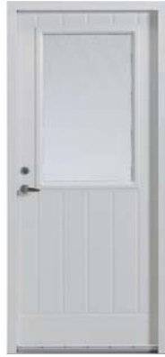
Edale Uvalue 1.4