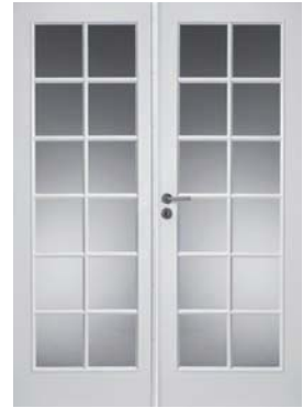
200/SP12 + SP12 White