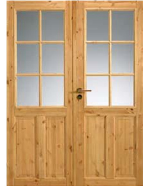
150/04SP6 + 04SP6 Cecilia