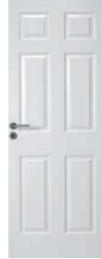
Dalsand 96/06 White