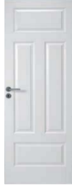
Gunilla 96/04N White