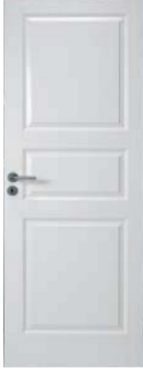
Annette 96/03 White