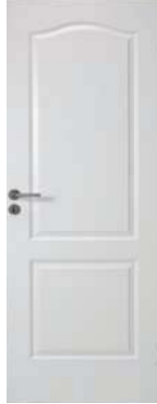
Karin 96/02B White