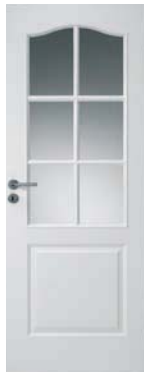
Karin 96/SP6B White