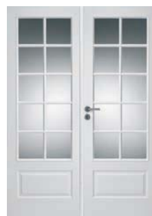
Gunilla 96/SP10 + SP10 White