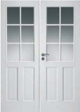
155/04SP6 + 04SP6 Cecilia