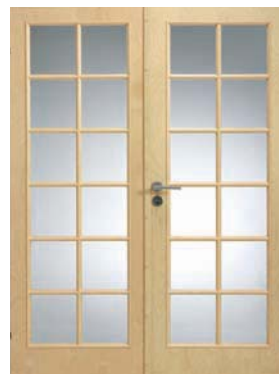
201/SP12 + SP12 Pair* Koto